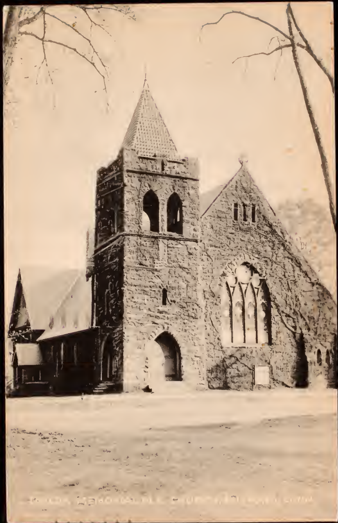
St. Mark's Episcopal Church, New York