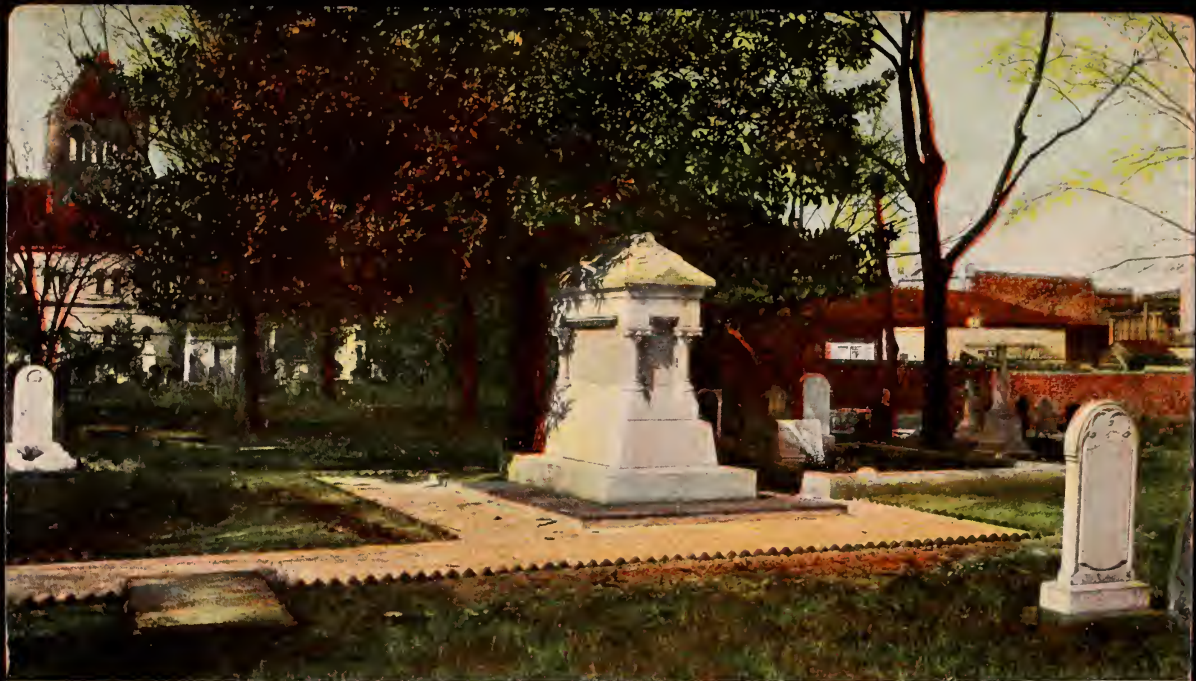
Charleston, S. C. Calhoun's Grave St. Philip's Church-yard.